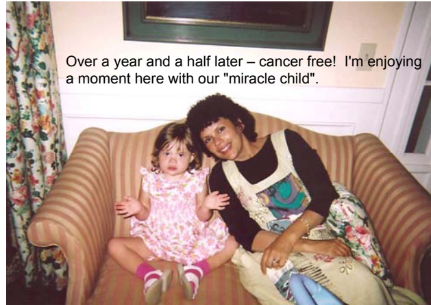
Over a year and a half later – cancer free! I'm enjoying a moment here with our "miracle child".