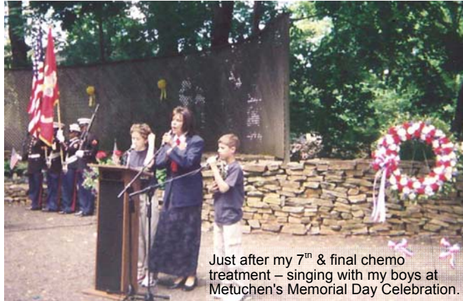
Just after my 7 th & final chemo treatment – singing with my boys at Metuchen's Memorial Day Celebration.

To this day, neighbors, friends, even doctors, comment on the amazing recovery that God has affected in my life and body. God helped me sing at our district conference a day after receiving a very strong chemical, Adriamycin, and, on May 30 th , 2005, after the last chemotherapy treatment, I sang "God Bless America" at Metuchen's Memorial Day parade and ceremony. Our church, A.C.T.S., is